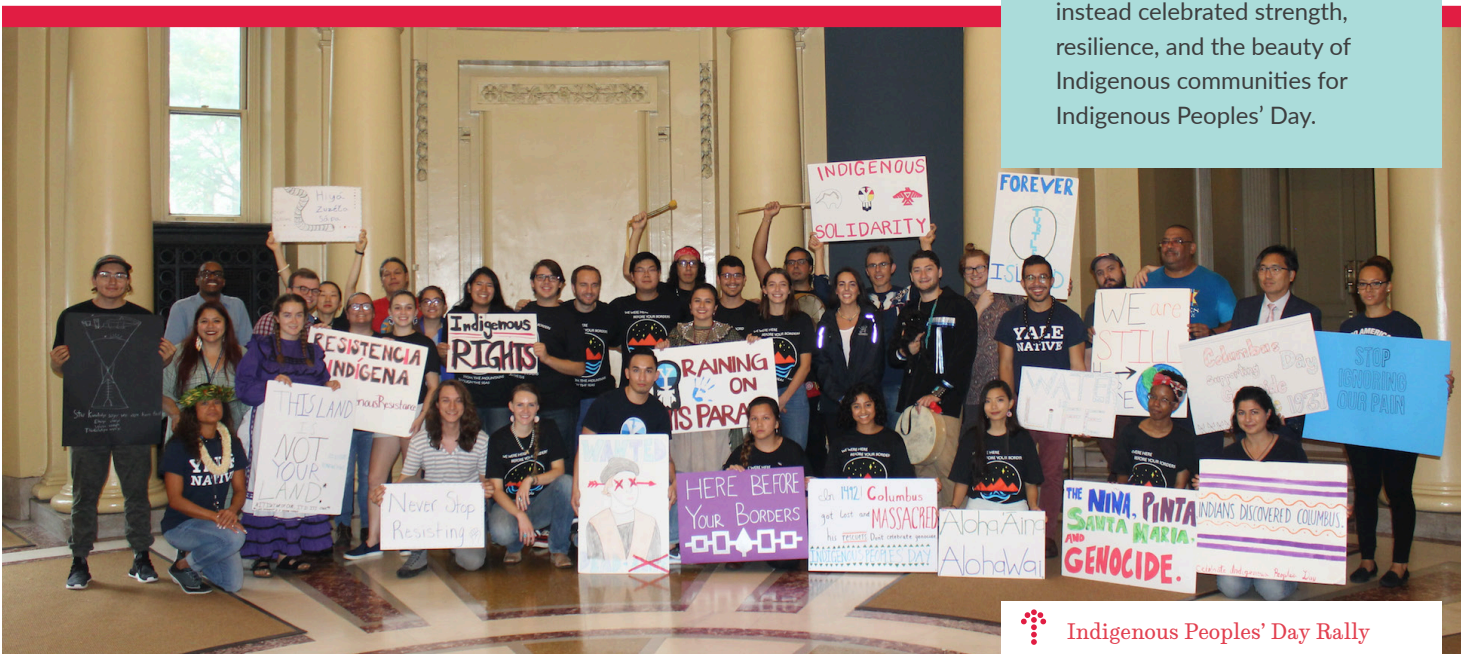
Indigenous Peoples' Day Rally