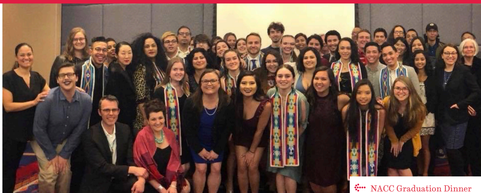
❖❖❖ NACC Graduation Dinner